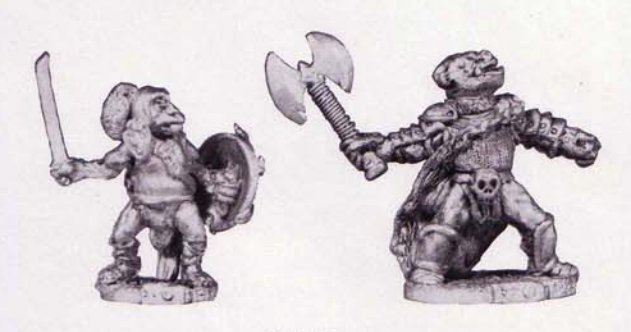
FMM1 2 of 3